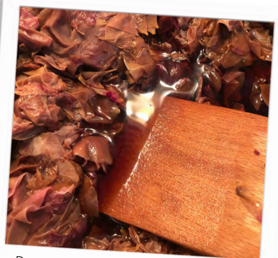
Rose petals simmering, I repeated this process with the avocado waste

I was inspired by the opulent Flemington rose gardens. The draped folds mimic the radiating curves of a rose. I also included roses in my design process. I natually dyed my fabric using spent rose petals from my garden, and my familys' advocado food waste (peel and seeds) as a fixative.